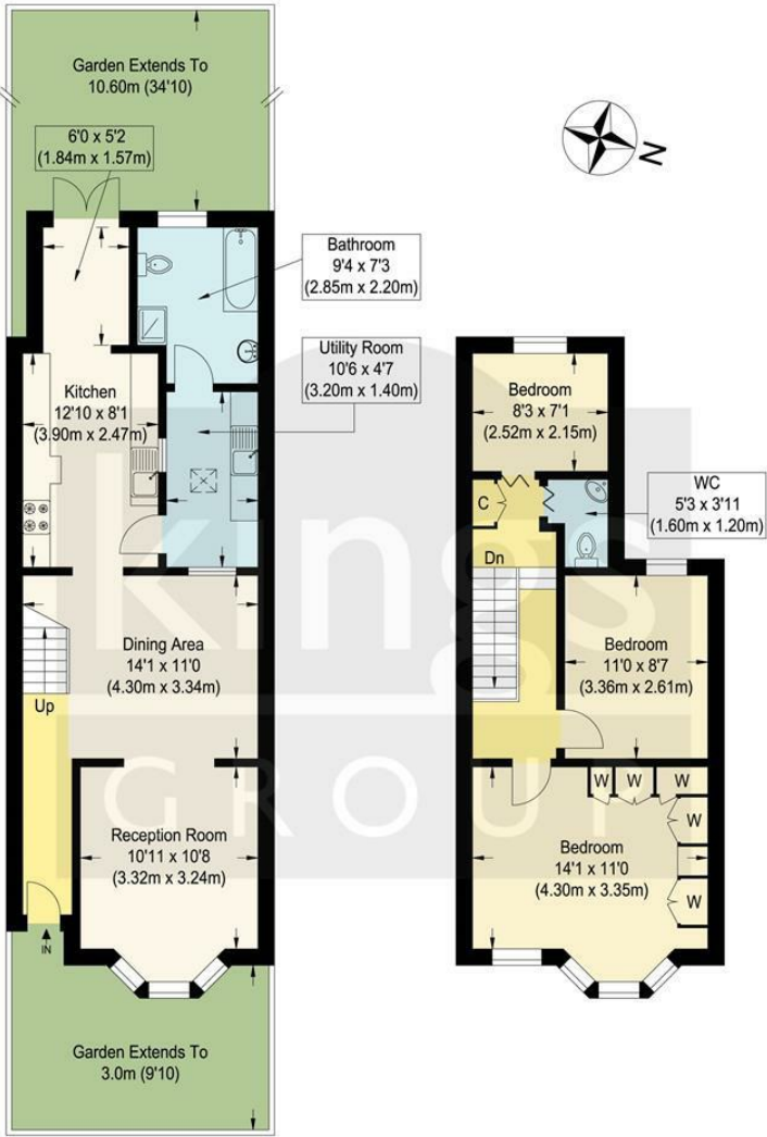
Ground Floor First Floor

Approximate Gross Internal Floor Area : 95.90 sq m / 1032.25 sq ft Illustration for identification purposes only, measurements are approximate, not to scale.