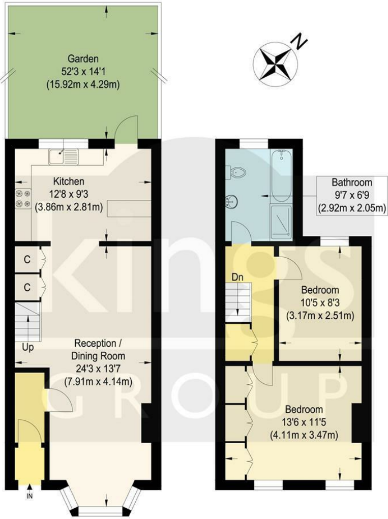
Ground Floor First Floor

Approximate Gross Internal Floor Area : 78.60 sq m / 846.04 sq ft Illustration for identification purposes only, measurements are approximate, not to scale.