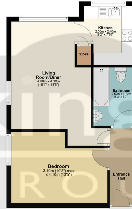
Total area: approx. 41.6 sq. metres (447.4 sq. feet)

All measurements have been taken as a guide to prospective buyers only and are not precise. This plan is for illustrative purposes only and no responsibility for any error, omission or misstatement. The services, systems and appliances shown have not been tested and no guarantee as to their operability or efficiency can be given. Measurements may have been taken from the widest area and may include wardrobe/cupboard space. No guarantee is given to any measurements including total areas. Buyers are advised to take their own measurements.