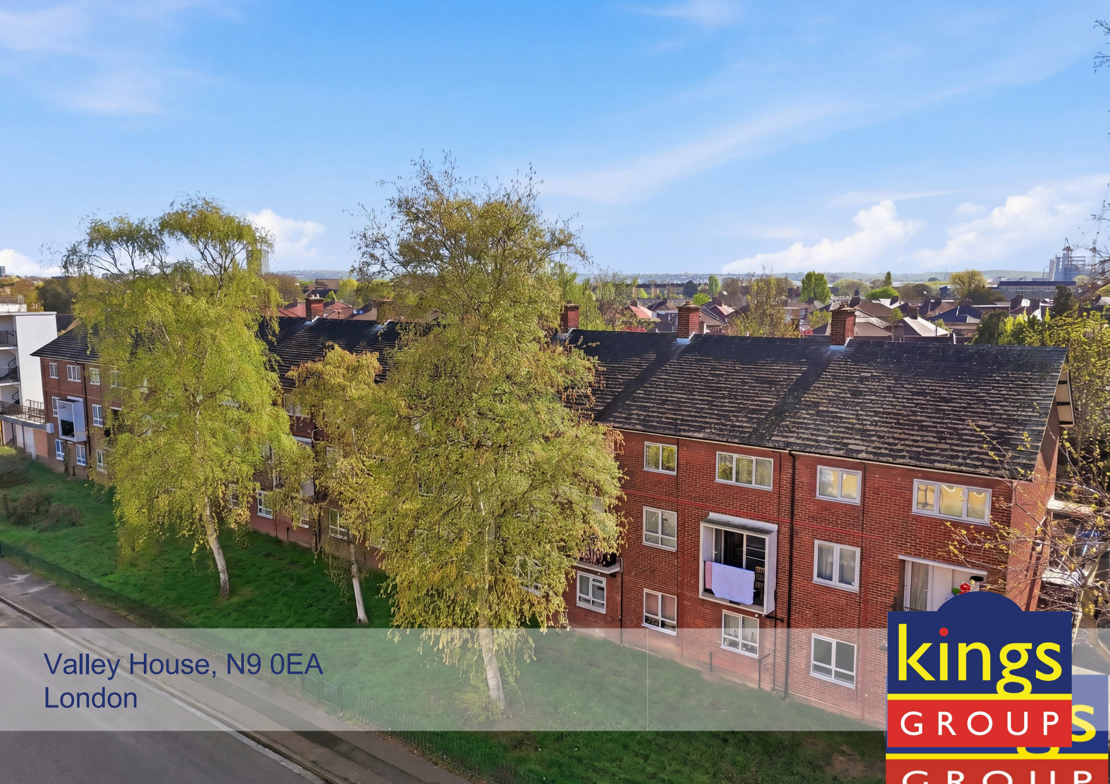
Valley House, N9 0EA London