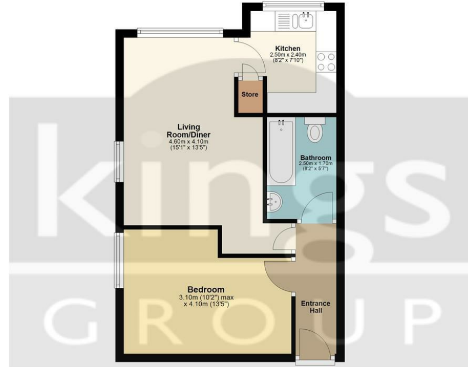
Total area: approx. 41.6 sq. metres (447.4 sq. feet)

All measurements have been taken as a guide to prospective buyers only and are not precise. This plan is for illustrative purposes only and no responsibility for any error, omission or misstatement. The services, systems and appliances shown have not been tested and no guarantee as to their operability or efficiency can be given. Measurements may have been taken from the widest area and may include wardrobe/cupboard space. No guarantee is given to any measurements including total areas. Buyers are advised to take their own measurements.