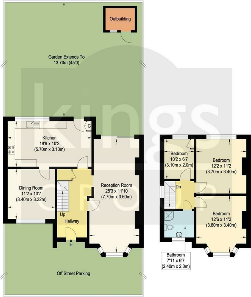
Ground Floor First Floor

Approximate Gross Internal Floor Area : 104.70 sq m / 1126.98 sq ft (Excluding Outbuilding)