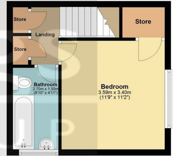
Total area: approx. 49.1 sq. metres (528.0 sq. feet)

All measurements have been taken as a guide to prospective buyers only and are not precise. This plan is for illustrative purposes only and no responsibility for any error, omission or misstatement. The services, systems and appliances shown have not been tested and no guarantee as to their operability or efficiency can be given. Measurements may have been taken from the widest area and may include wardrobe/cupboard space. No guarantee is given to any measurements including total areas. Buyers are advised to take their own measurements.