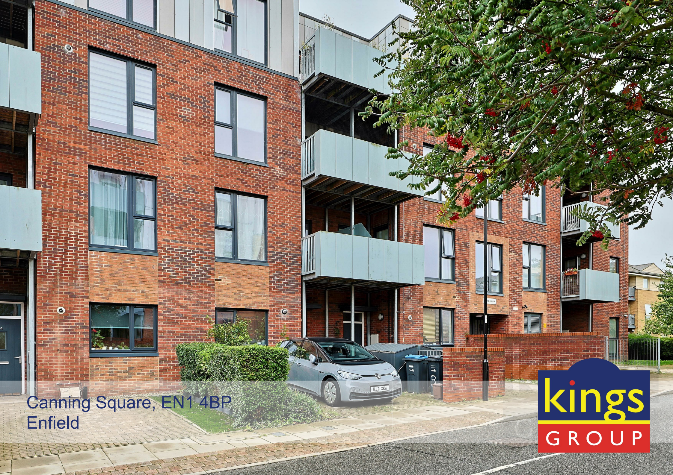
Canning Square, EN1 4BP Enfield