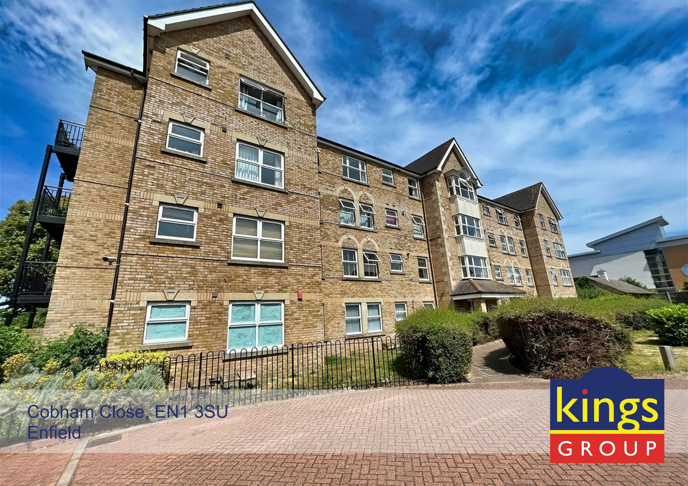
Cobham Close, EN1 3SU Enfield