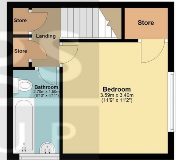
Total area: approx. 49.1 sq. metres (528.0 sq. feet)

All measurements have been taken as a guide to prospective buyers only and are not precise. This plan is for illustrative purposes only and no responsibility for any error, omission or misstatement. The services, systems and appliances shown have not been tested and no guarantee as to their operability or efficiency can be given. Measurements may have been taken from the widest area and may include wardrobe/cupboard space. No guarantee is given to any measurements including total areas. Buyers are advised to take their own measurements.