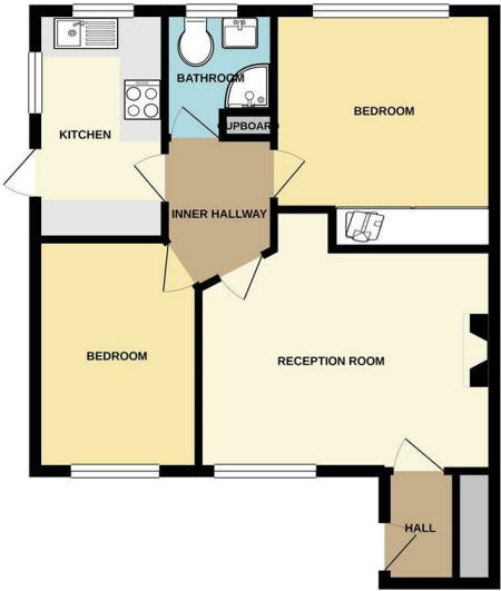
TOTAL FLOOR AREA: 53.0 sq.m. (570 sq.ft.) approx. Whilst every attempt has been made to ensure the accuracy of the floorplan contained herein, measurements of doors, windows, stairs and any other items are approximate and no responsibility is taken for any gross error or inaccuracy. This plan is for illustrative purposes only and should be used as a guide only and not for prospective purchase. The services, systems and appliances shown have not been tested and no guarantee is given for their operation or efficiency on the given date. Made with Manager 12002