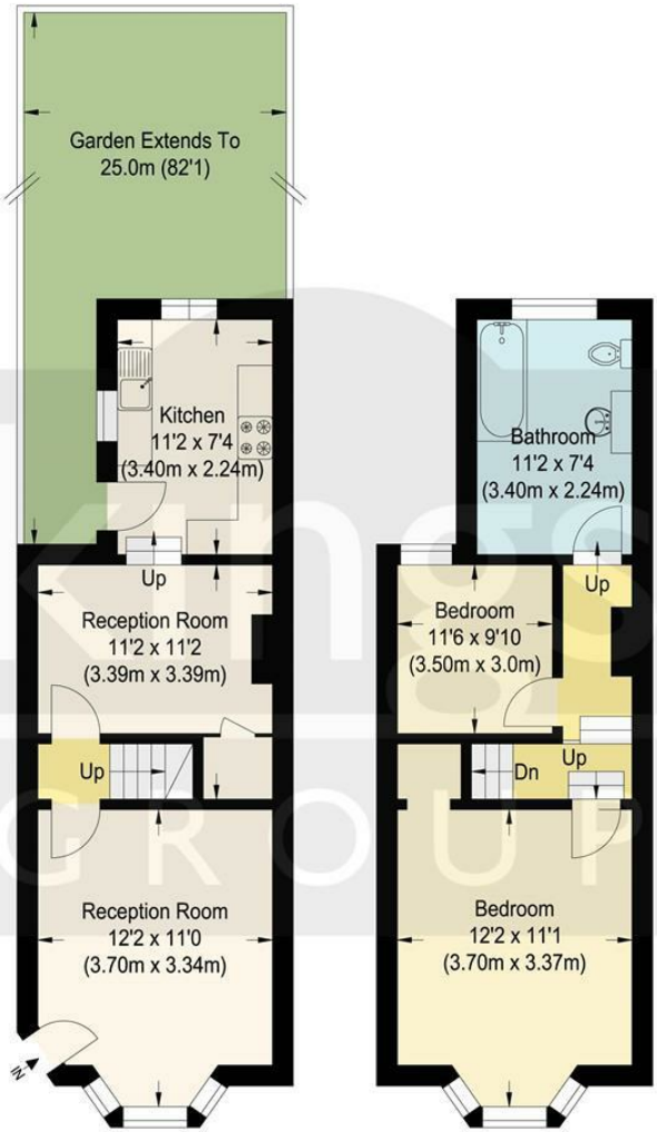
Ground Floor First Floor

Approximate Gross Internal Floor Area : 66.6 sq m / 716.87 sq ft Illustration for identification purposes only, measurements are approximate, not to scale.