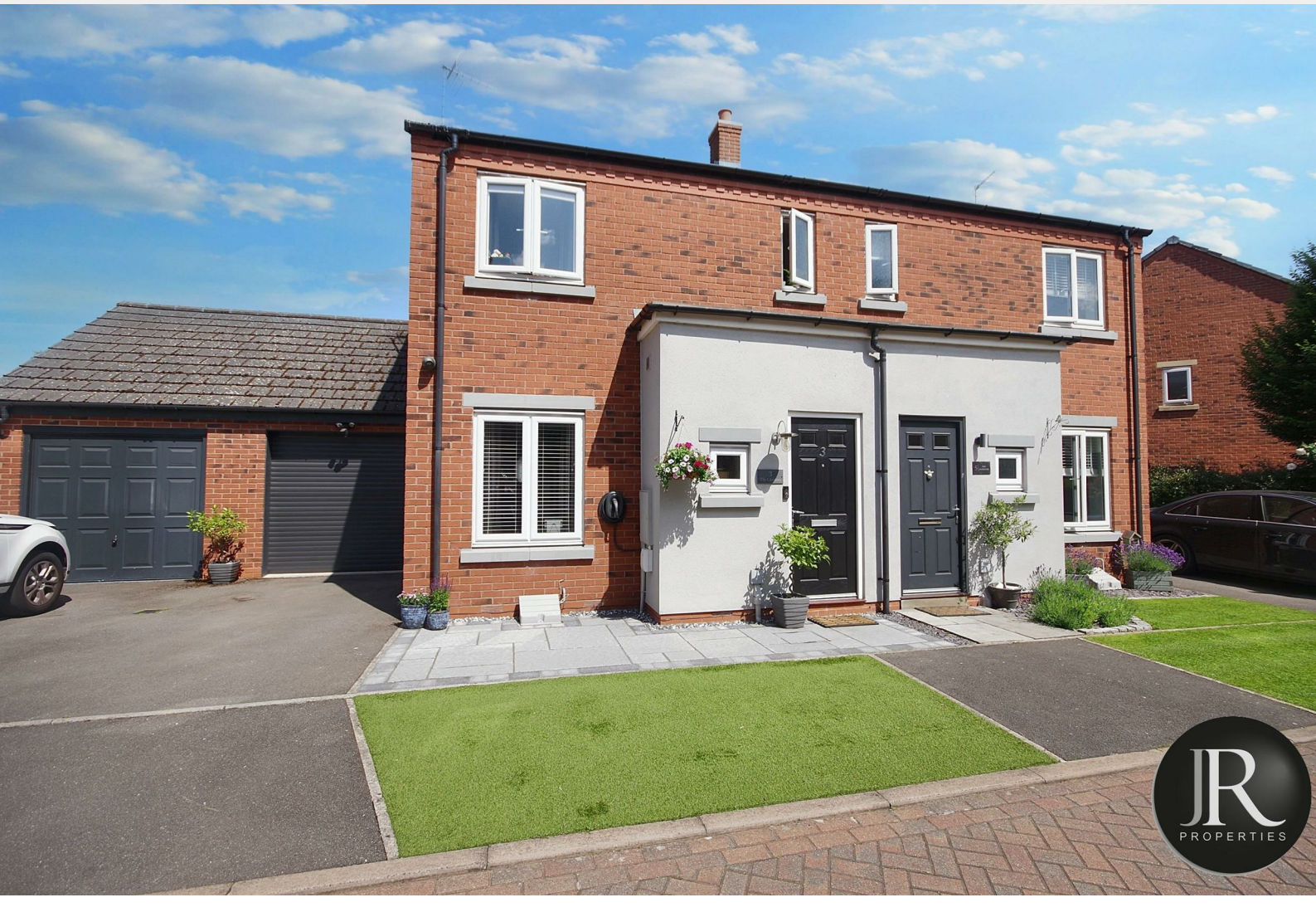
3 The Cloisters, Rugeley, WS15 1GW Guide Price £230,000