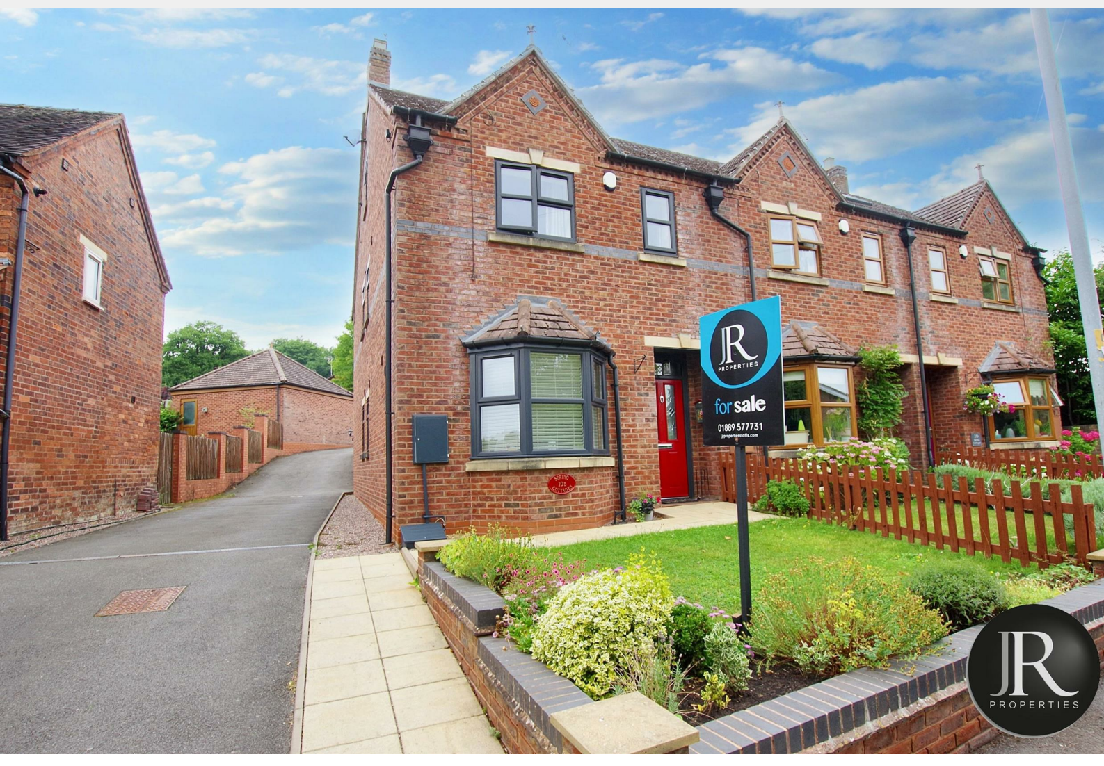
10b Spring Cottages Slitting Mill Road, Slitting Mill, WS15 2UN Offers In The Region Of £395,000