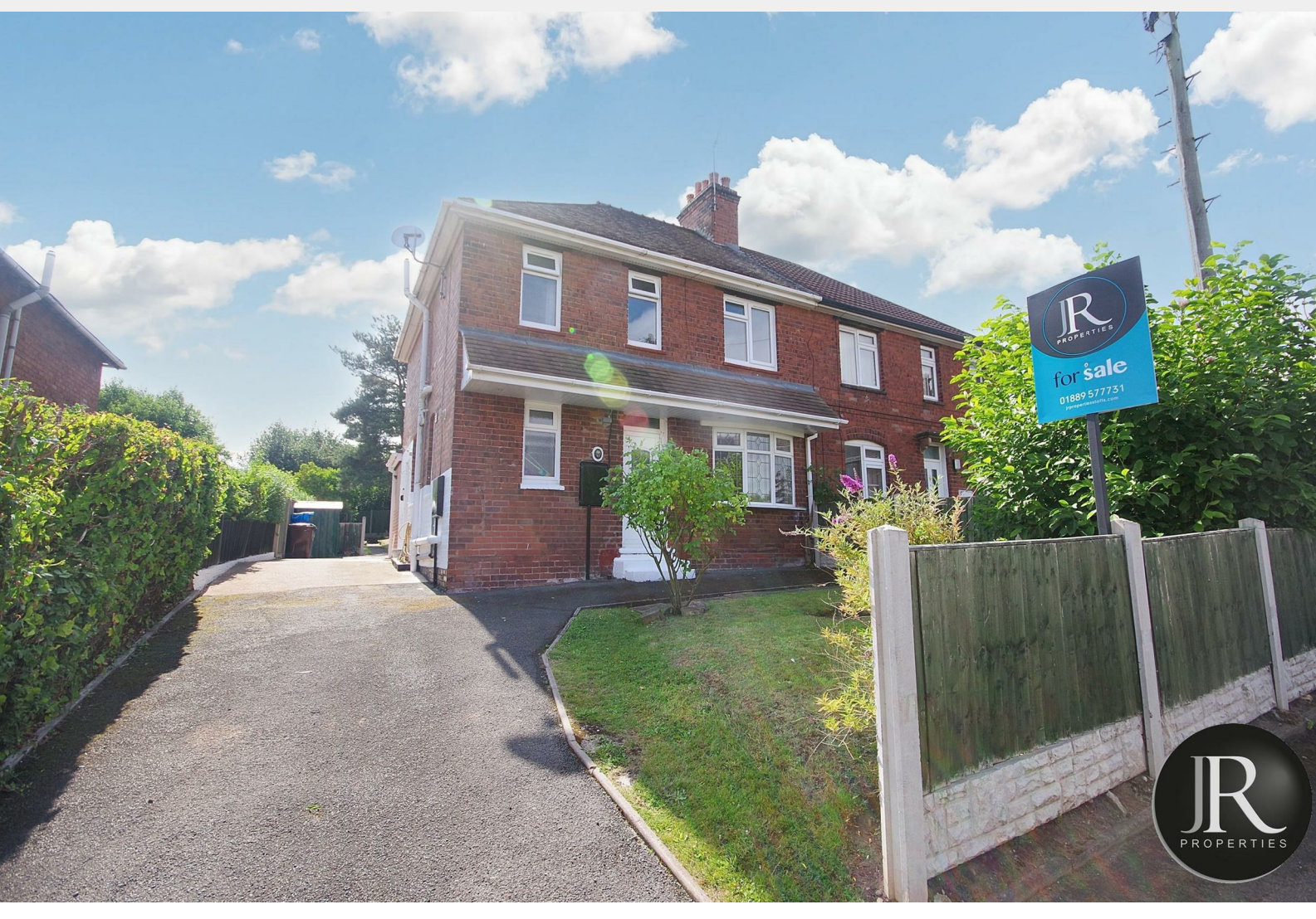
41 Cross Road, Rugeley, WS15 2JF Guide Price £239,950