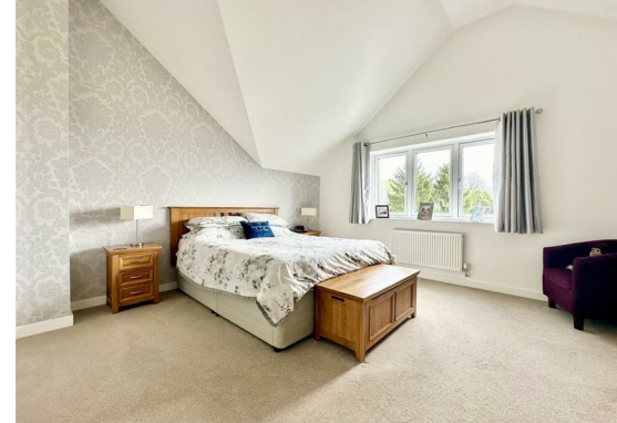
Bedroom 3 12'8 x 12'6 (3.86m x 3.81m)