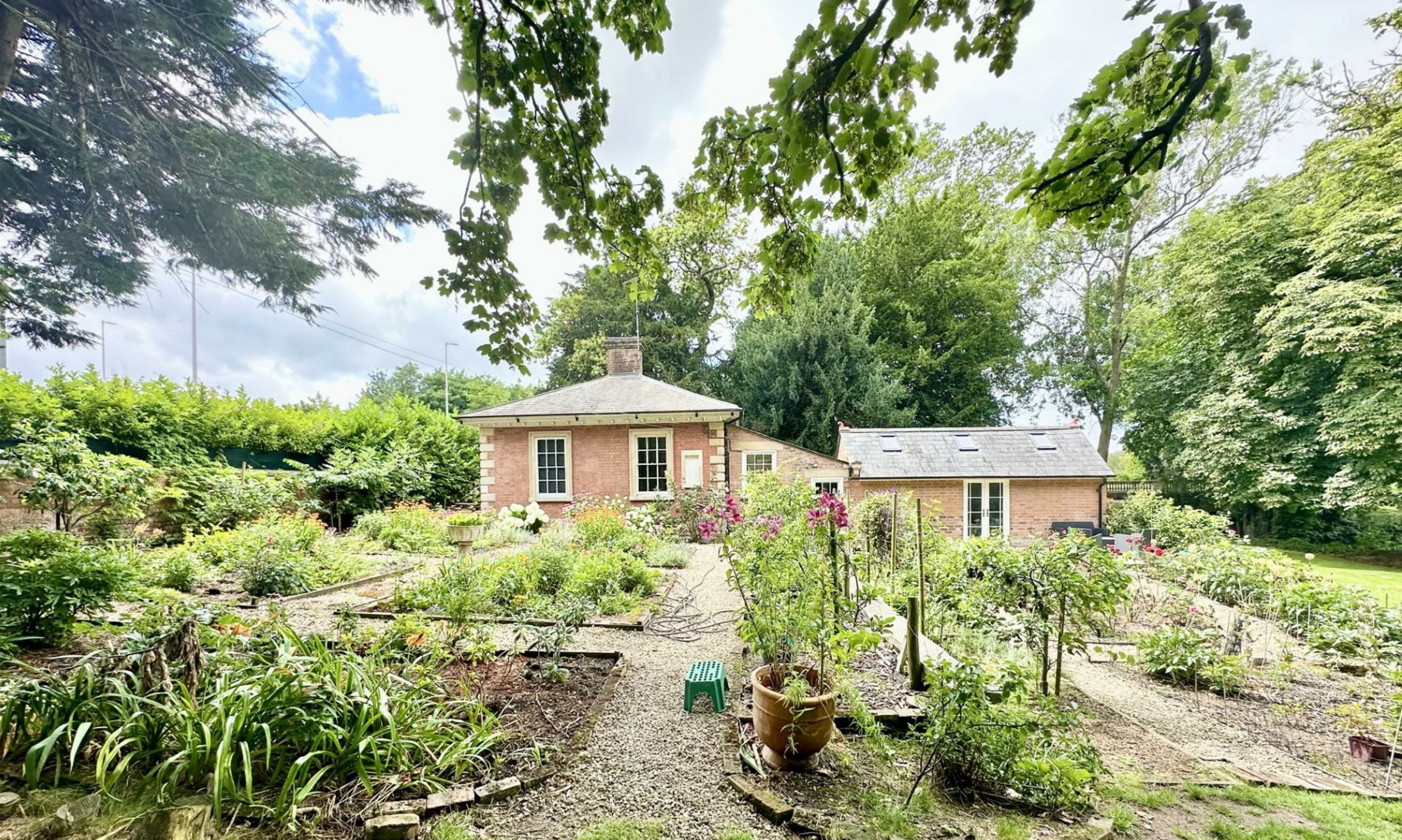
Chepstow Lodge , Highnam, GL2 8DF