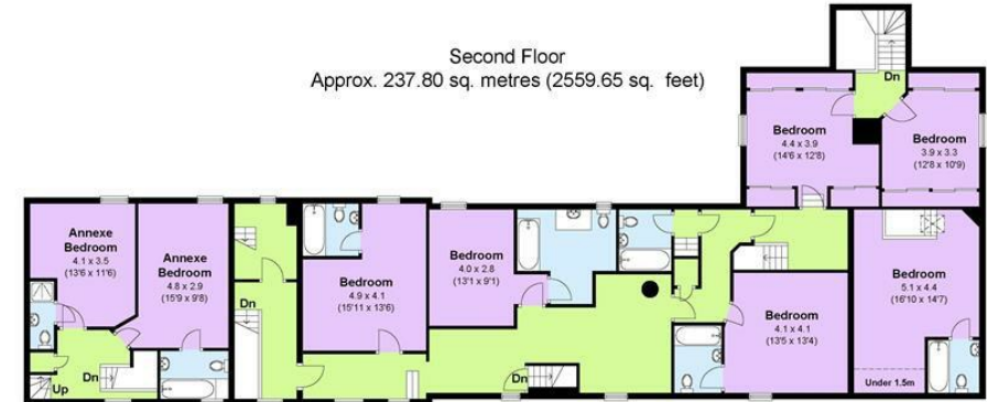
Second Floor Approx. 237.80 sq. metres (2559.65 sq. feet)