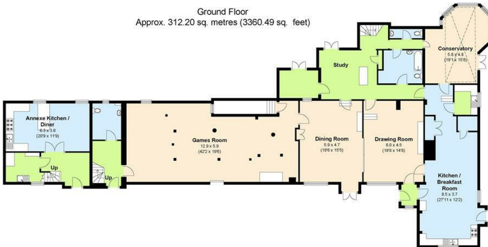
Ground Floor Approx. 312.20 sq. metres (3360.49 sq. feet)