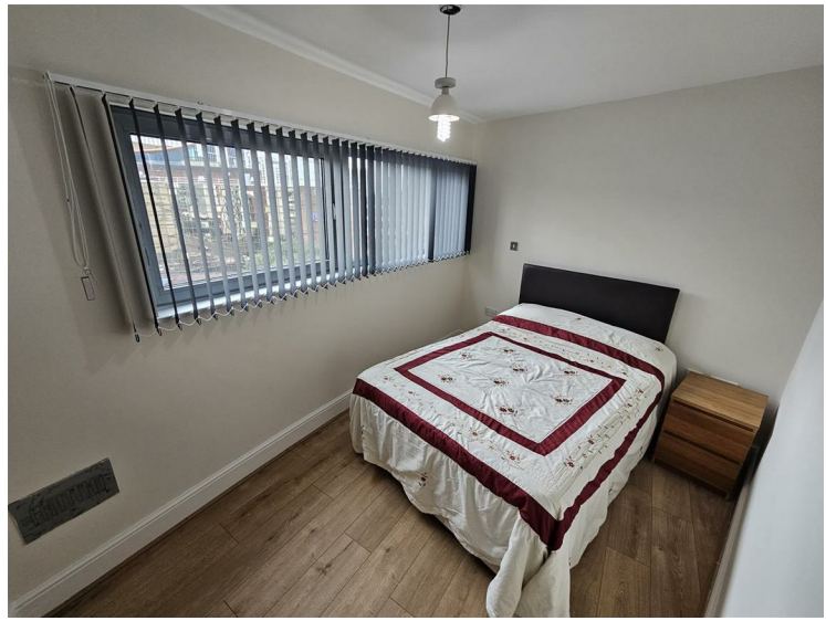
En Suite Shower Room W.C.