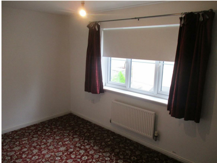
En Suite Shower Room W.C.