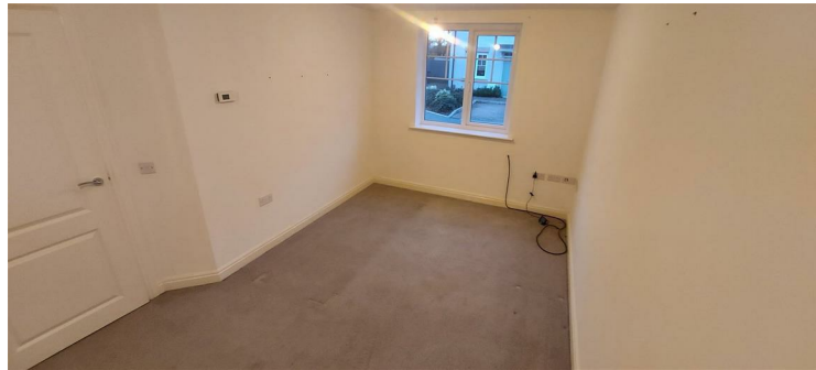
Kitchen Breakfast Room