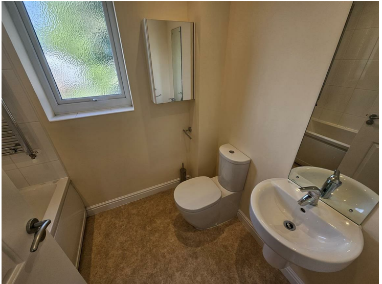
Front & Side Garden Rear Garden