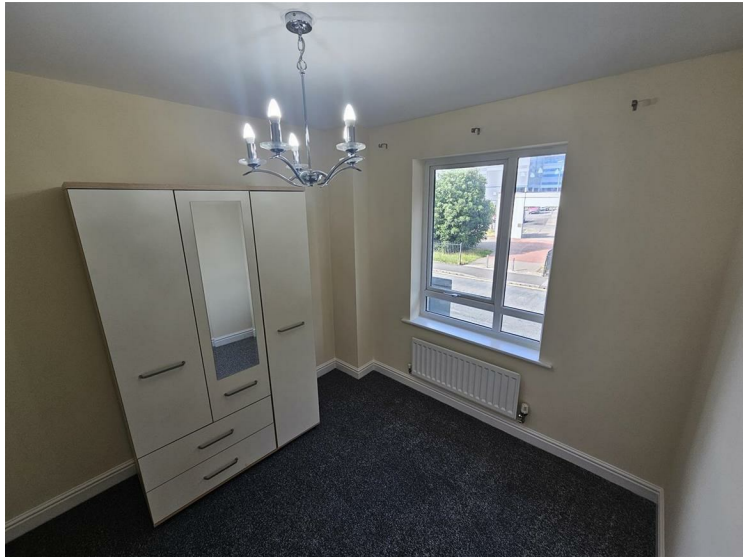
Bedroom Three Family Bathroom