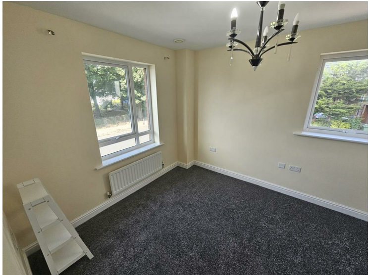
En-Suite Bedroom Two