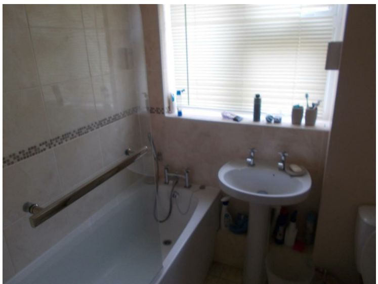
Communal Gardens & Parking