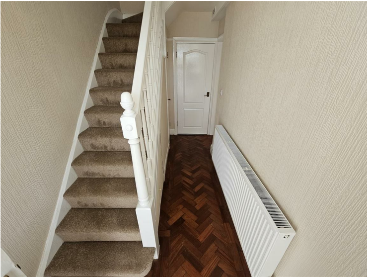
Porch Entrance Hall