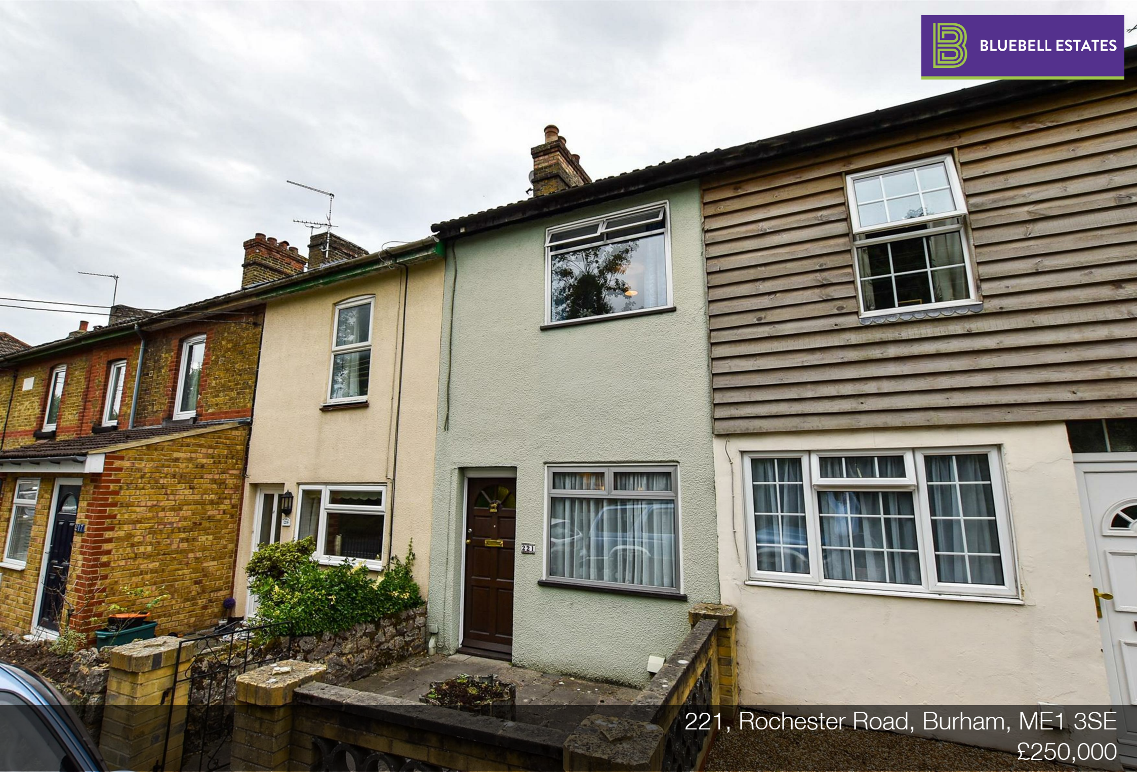
221, Rochester Road, Burham, ME1 3SE £250,000