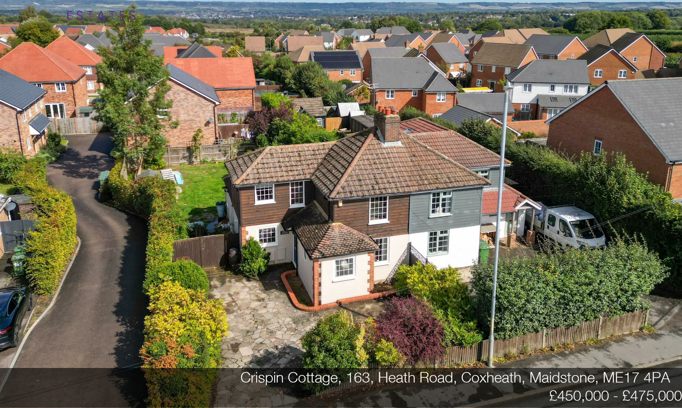
Crispin Cottage, 163, Heath Road, Coxheath, Maidstone, ME17 4PA £450,000 - £475,000