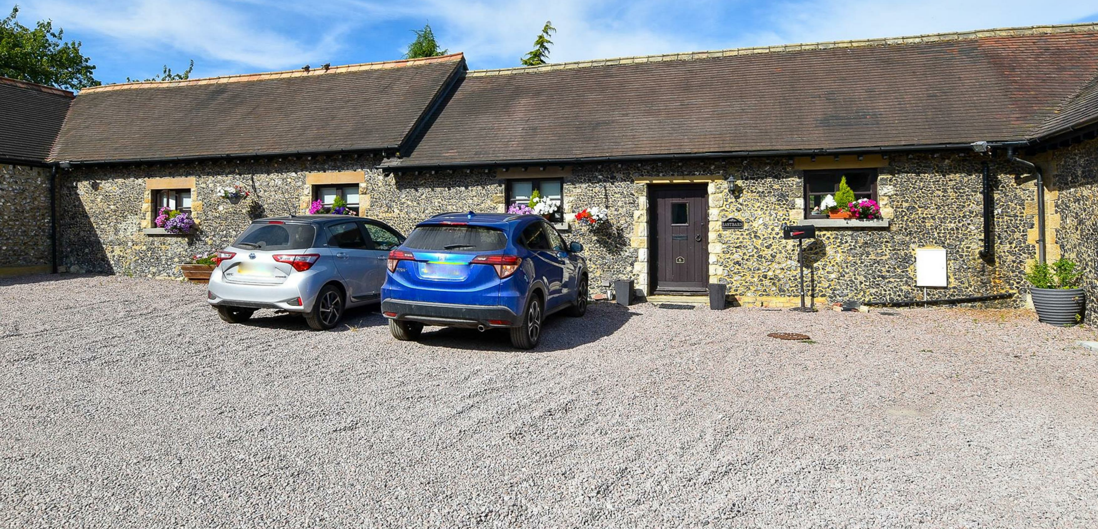
East Barn, Great Cossington Farm, Pratling Street, Aylesford, ME20 7DQ £1,600 Per Month