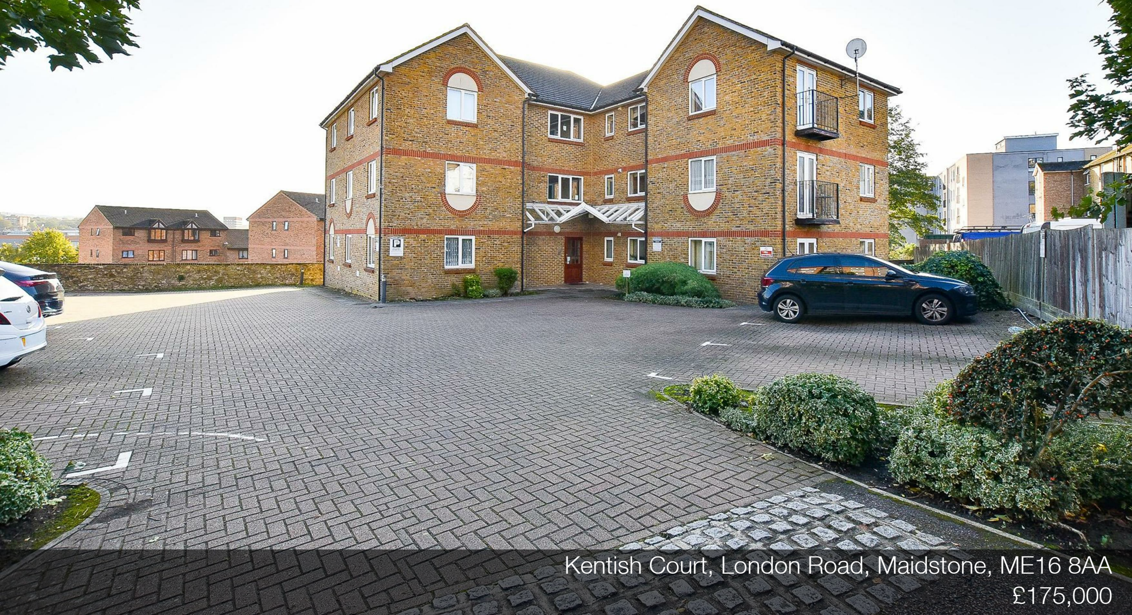
Kentish Court, London Road, Maidstone, ME16 8AA £175,000