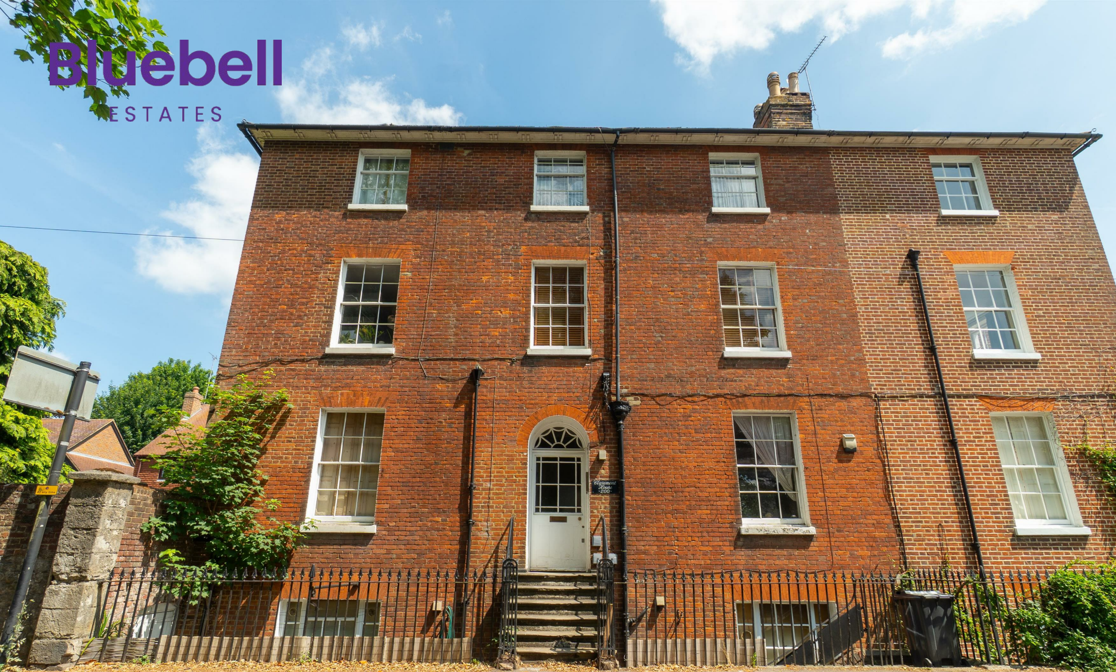
Claremont House, Tonbridge Road, Watlingbury, Maidstone, ME18 5NU £200,000