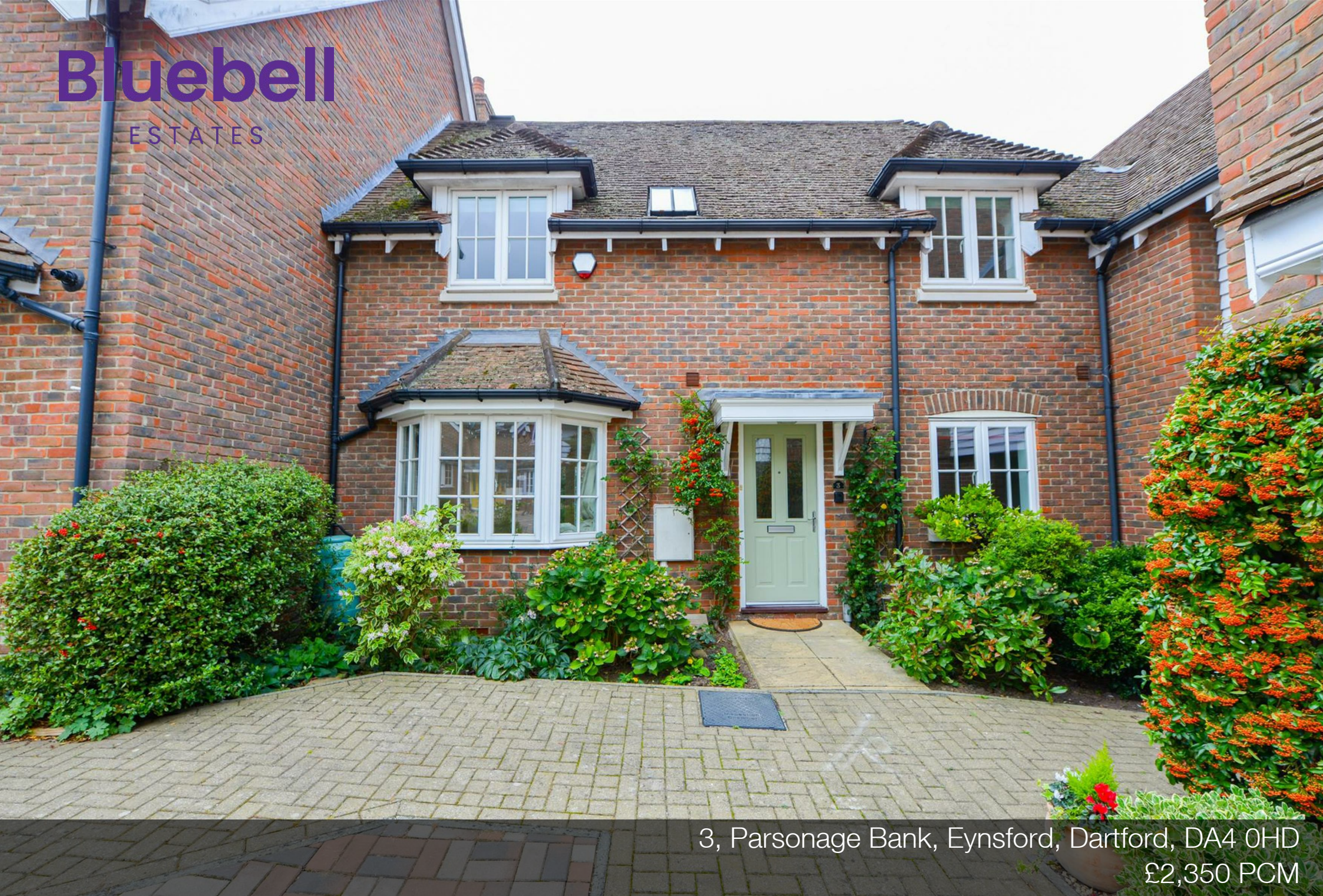
3, Parsonage Bank, Eynsford, Dartford, DA4 0HD £2,350 PCM