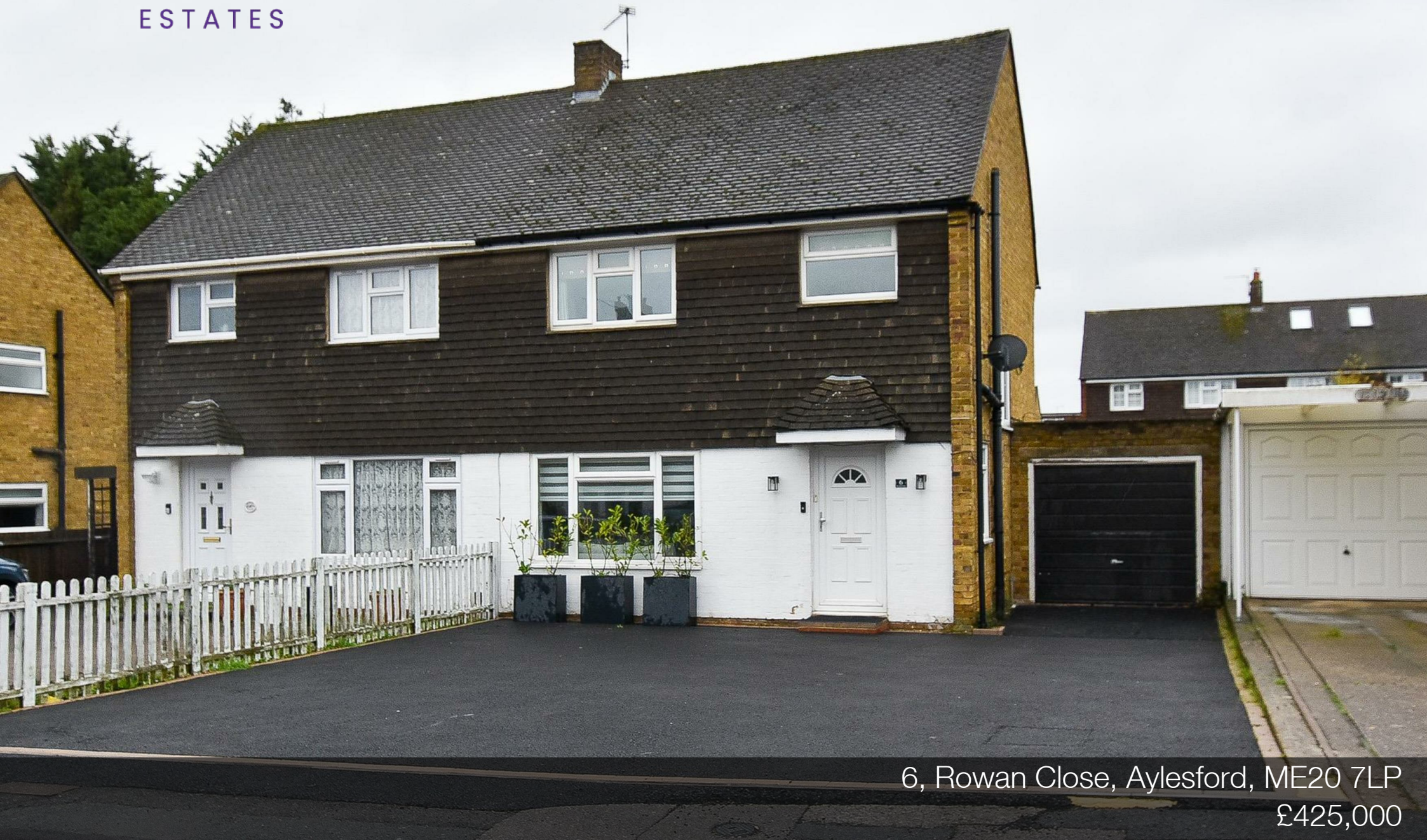
6, Rowan Close, Aylesford, ME20 7LP £425,000