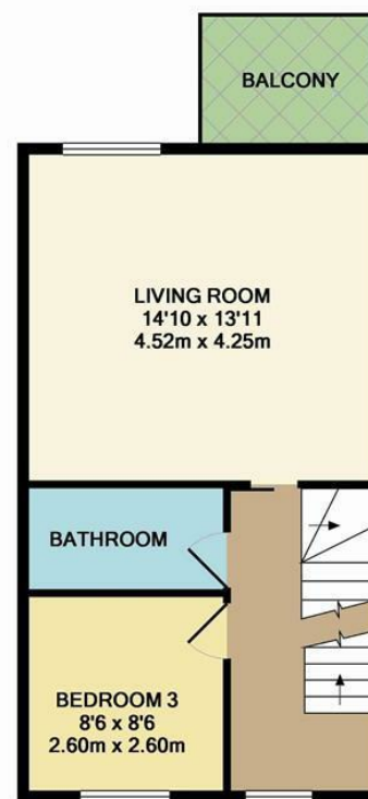
1ST FLOOR APPROX. FLOOR AREA 403 SQ.FT. (37.4 SQ.M.)