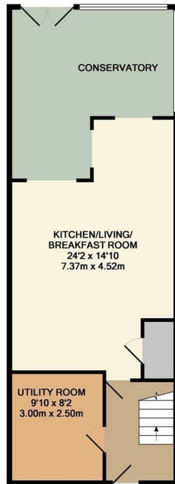
GROUND FLOOR APPROX. FLOOR AREA 635 SQ.FT. (59.0 SQ.M.)