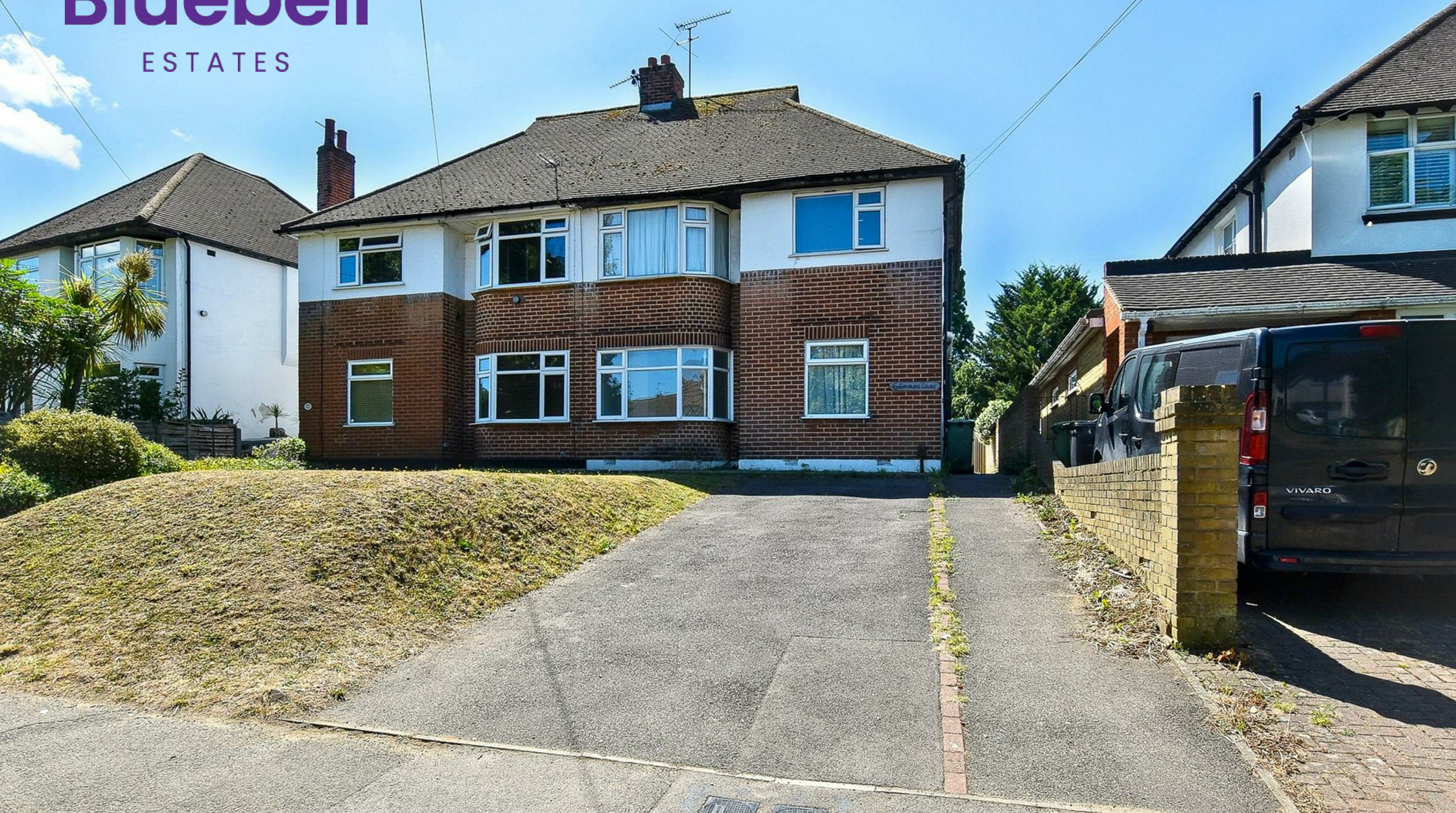
6, Sandling Court, Sandling Lane, Penenden Heath, Maidstone, ME14 2HR £195,000