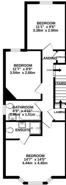
1ST FLOOR 543 sq.ft. (50.4 sq.m.) approx.