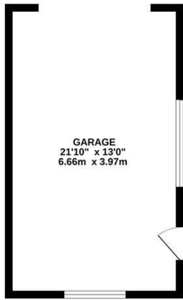
GARAGE 285 sq.ft. (26.4 sq.m.) approx.