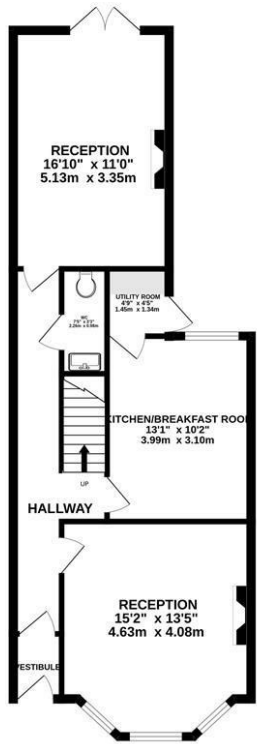
GROUND FLOOR 682 sq.ft. (63.3 sq.m.) approx.