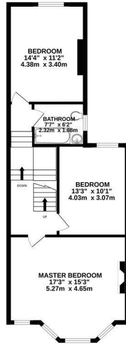
1ST FLOOR 688 sq.ft. (63.9 sq.m.) approx.