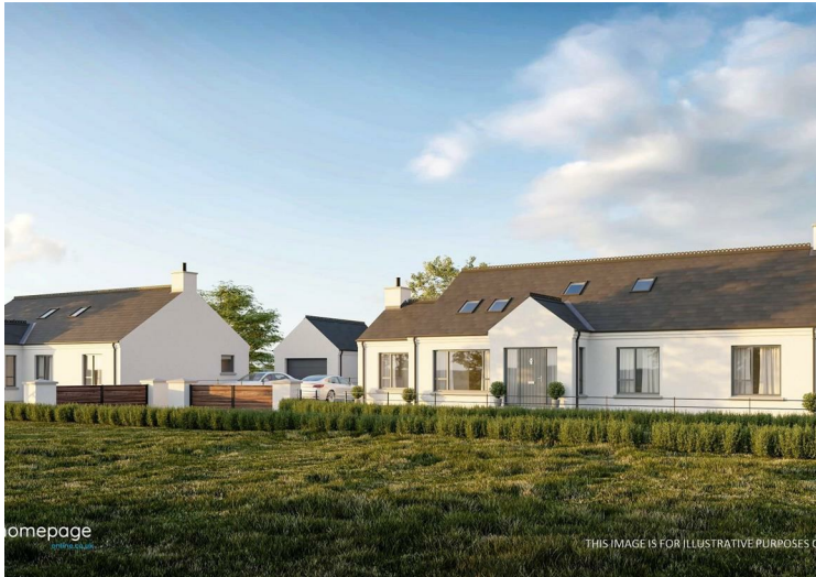
THIS IMAGE IS FOR ILLUSTRATIVE PURPOSES ONLY