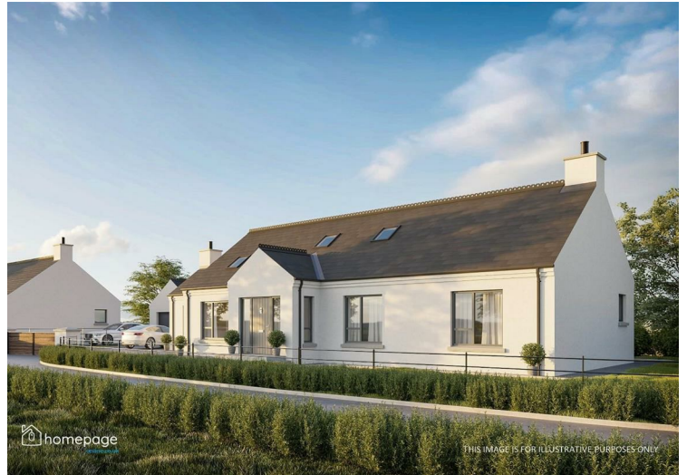
THIS IMAGE IS FOR ILLUSTRATIVE PURPOSES ONLY