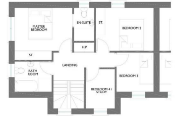
SITE 3 - HOUSE TYPE 2 FIRST FLOOR PLAN