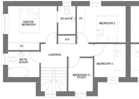
SITE 3 - HOUSE TYPE 2 FIRST FLOOR PLAN