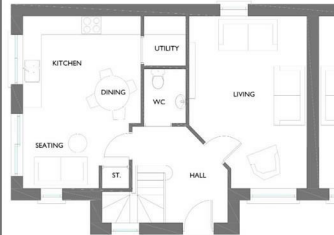
SITE 3 - HOUSE TYPE 2 / 1180sqft GROUND FLOOR PLAN