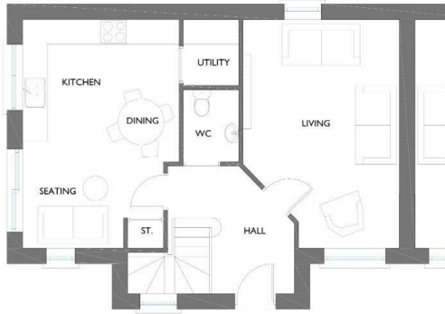
SITE 3 - HOUSE TYPE 2 / 1180sqft GROUND FLOOR PLAN