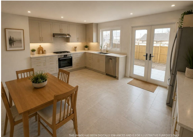
THIS IMAGE HAS BEEN DIGITALLY ENHANCED AND IS FOR ILLUSTRATIVE PURPOSES ONLY