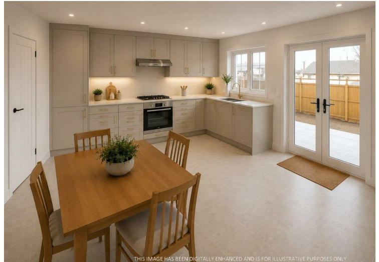
THIS IMAGE HAS BEEN DIGITALLY ENHANCED AND IS FOR ILLUSTRATIVE PURPOSES ONLY