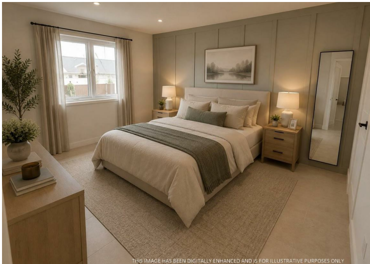
THIS IMAGE HAS BEEN DIGITALLY ENHANCED AND IS FOR ILLUSTRATIVE PURPOSES ONLY