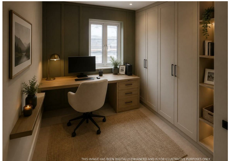
THIS IMAGE HAS BEEN DIGITALLY ENHANCED AND IS FOR ILLUSTRATIVE PURPOSES ONLY

These particulars, whilst believed to be accurate are set out as a general outline only for guidance and do not constitute any part of an offer or contract. Intending purchasers should not rely on them as statements of representation of fact, but must satisfy themselves by inspection or otherwise as to their accuracy. No person in this firm's employment has the authority to make or give any representation or warranty in respect of the property.