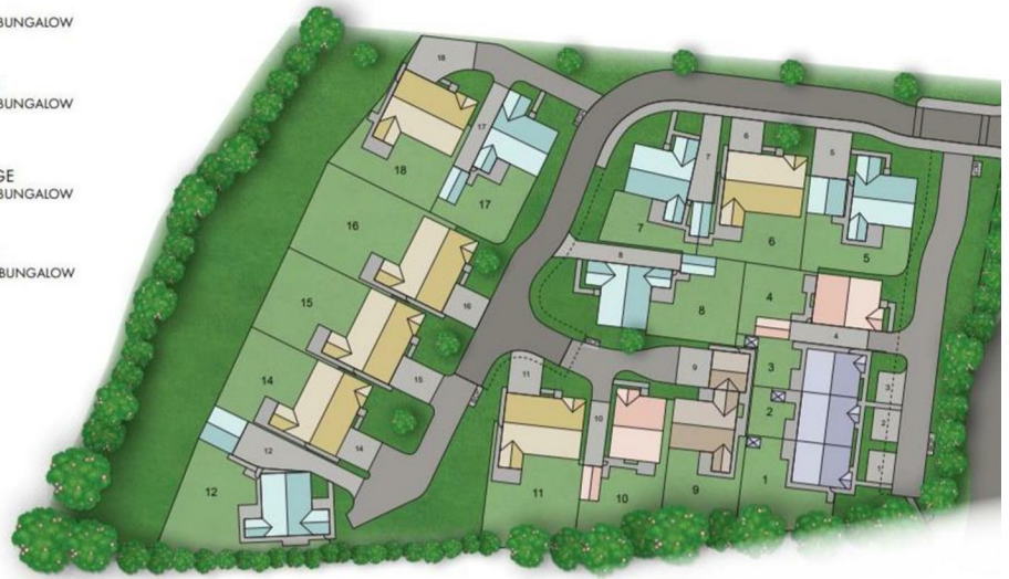
THE WOBURN THREE BEDROOM BUNGALOW