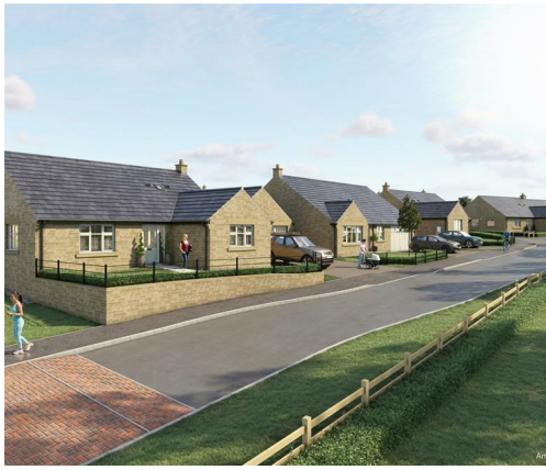
THE GAINSBOROUGH 20 BEDROOM BUNGALOW