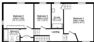
First Floor Floor area 76.3 sq.m. (821 sq.ft.)