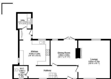
Ground Floor Floor area 85.5 sq.m. (920 sq.ft.)