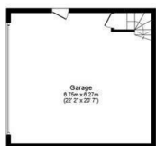
Garage Ground Floor Floor area 42.3 sq.m. (456 sq.ft.)