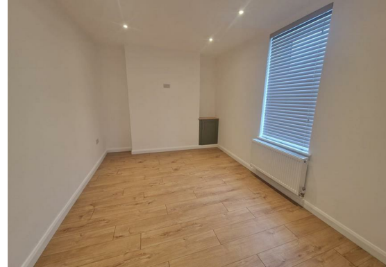
Bedroom 2 11'4" x 11'5" (3.459 x 3.484)