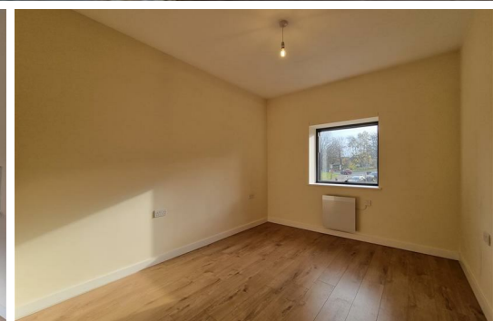
1 Bedroomed Modern open plan flat in Courtyard setting. Available from July