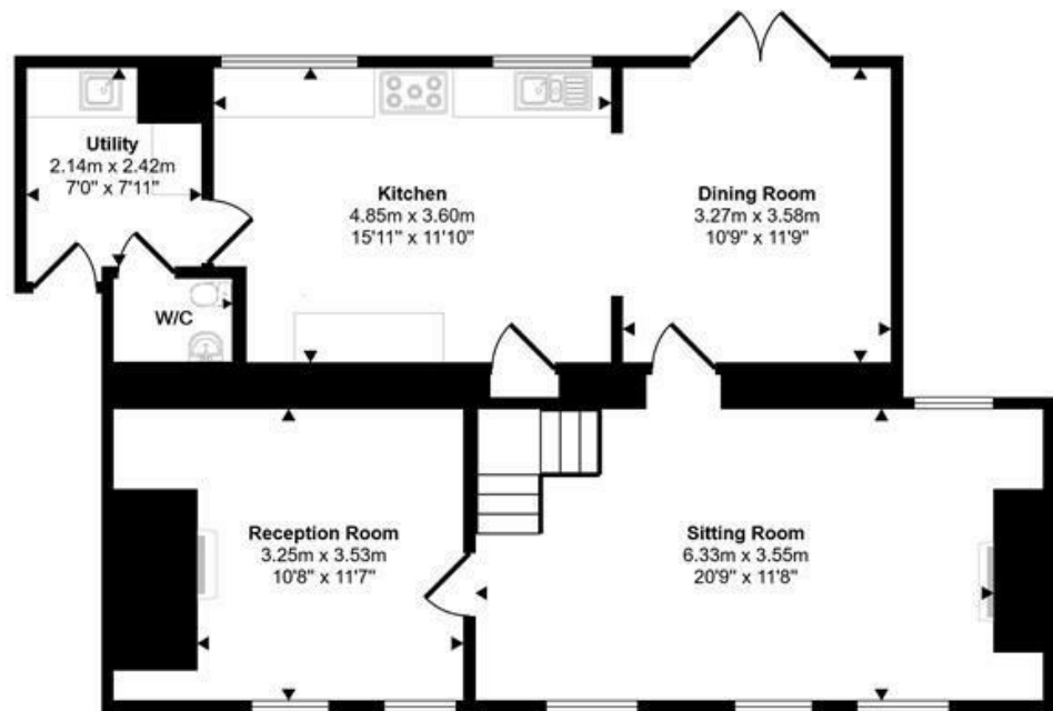
Ground Floor Approx 83 sq m / 889 sq ft

Approx Gross Internal Area 158 sq m / 1696 sq ft