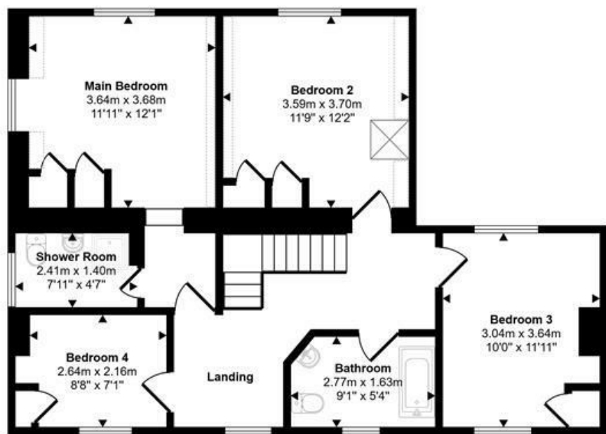
First Floor Approx 75 sq m / 807 sq ft