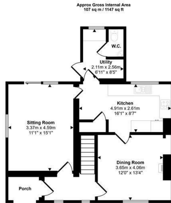
Ground Floor Approx 56 sq m / 598 sq ft