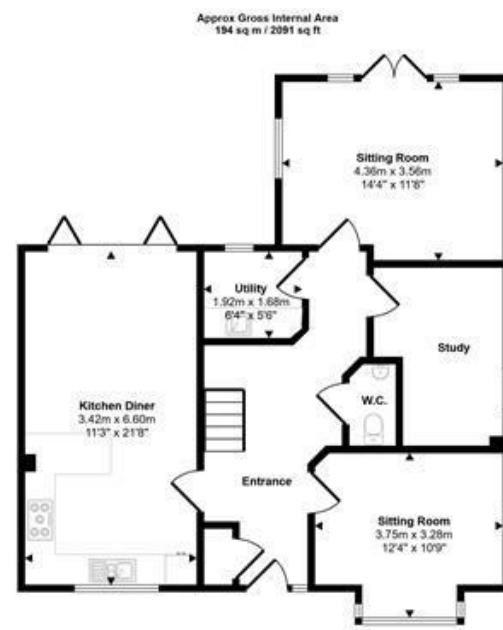
Ground Floor Approx 79 sq m / 850 sq ft