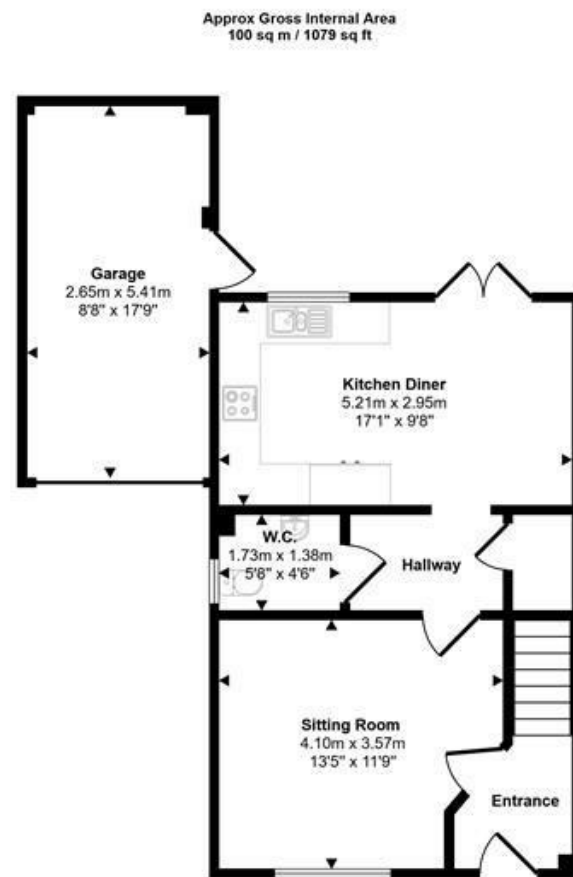
Ground Floor Approx 57 sq m / 617 sq ft