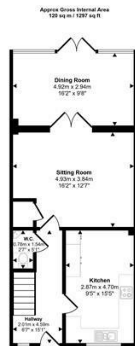
Ground Floor Approx 59 sq m / 635 sq ft