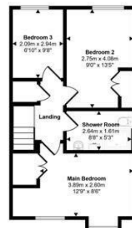
First Floor Approx 44 sq m / 471 sq ft