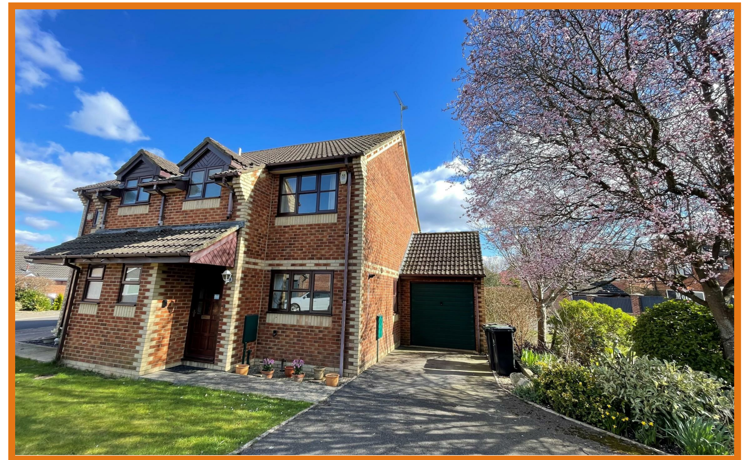
Dashwood Close Sturminster Newton