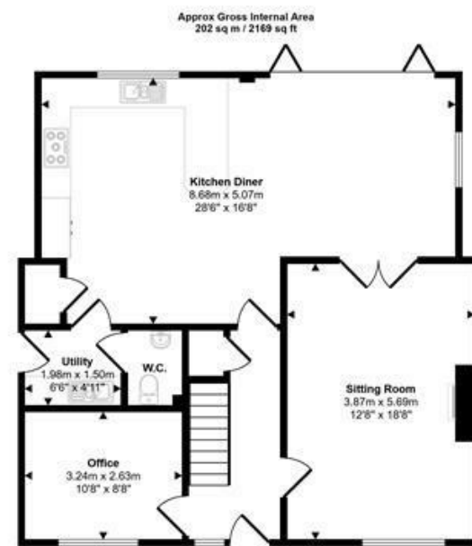
Ground Floor Approx 86 sq m / 929 sq ft